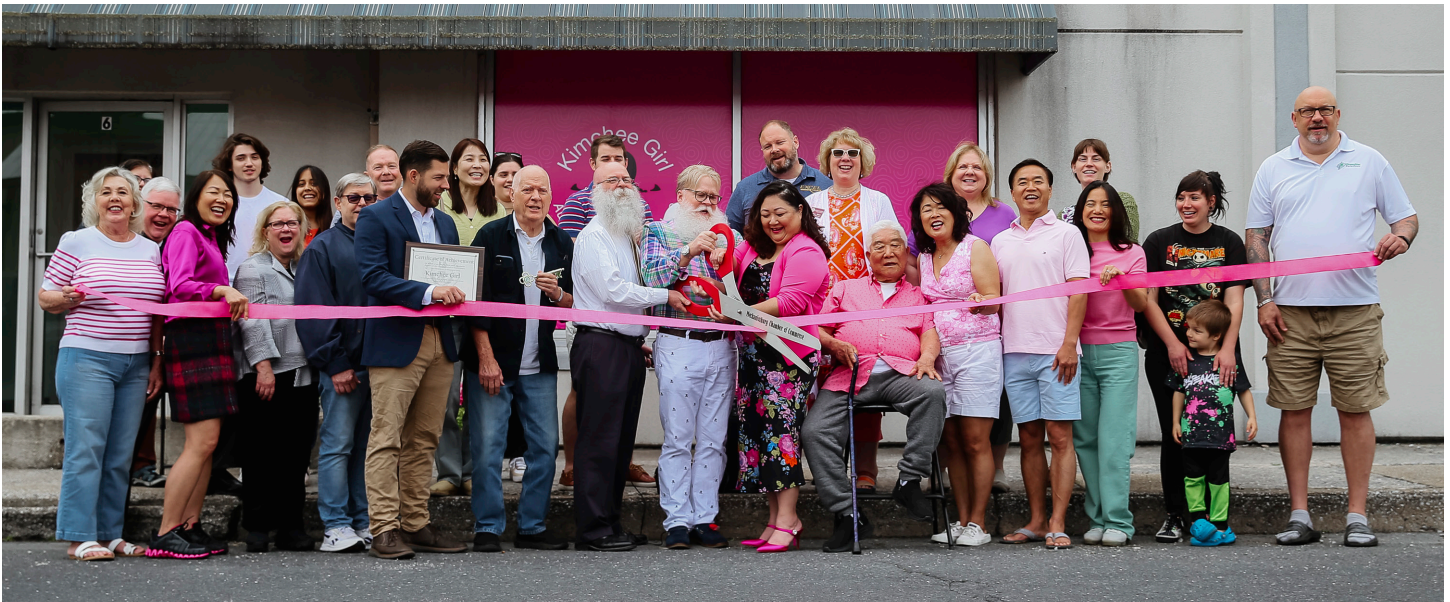
Above photo courtesy of Christina Hoy Photography